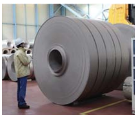
Wide-width Magnesium Coil